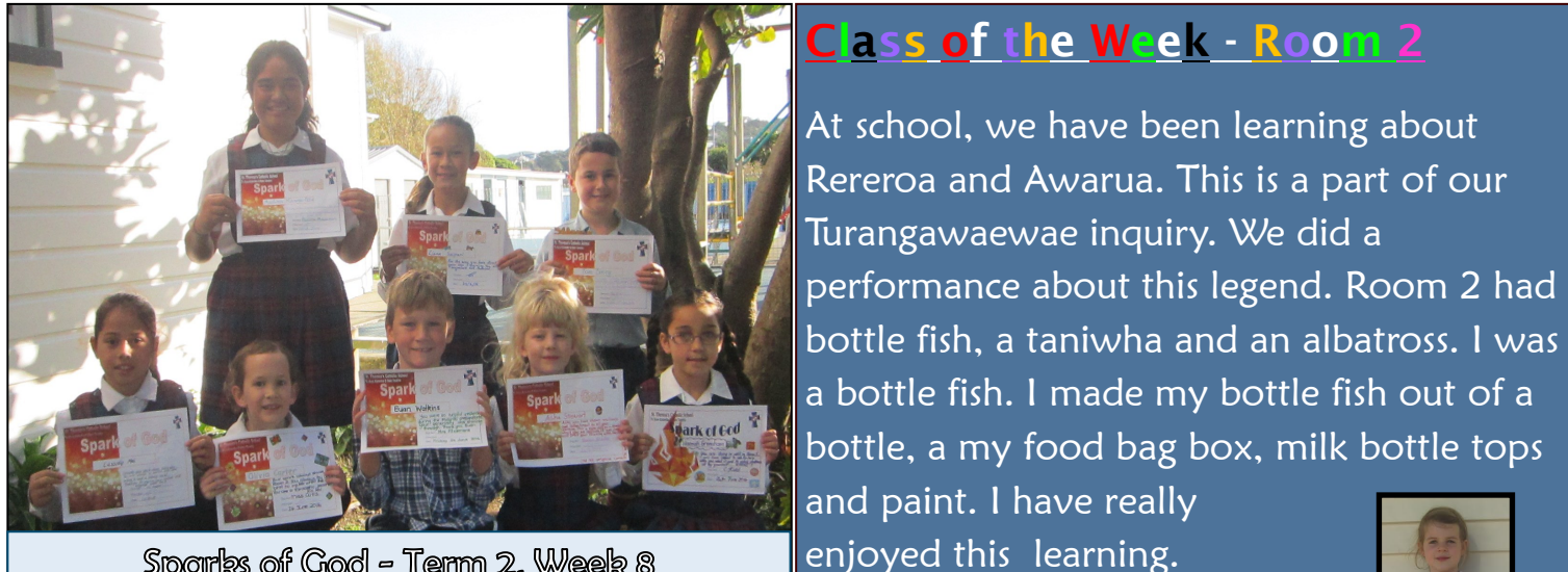
Sparks of God - Term 2, Week 8