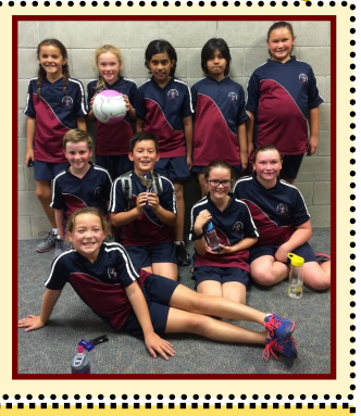
We congratulate the children who participated in the Weet-Bix Kids Tryathlon over the weekend. Well done!