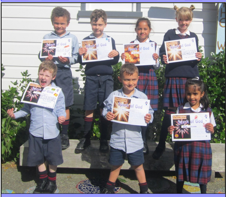
Sparks of God - Week 10

Sunday is the day to say to God: thank you Lord, for life, for your mercy and for all your gifts! - Pope Francis