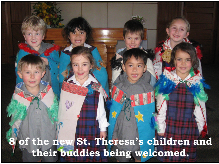
8 of the new St. Theresa's children and their buddies being welcomed.